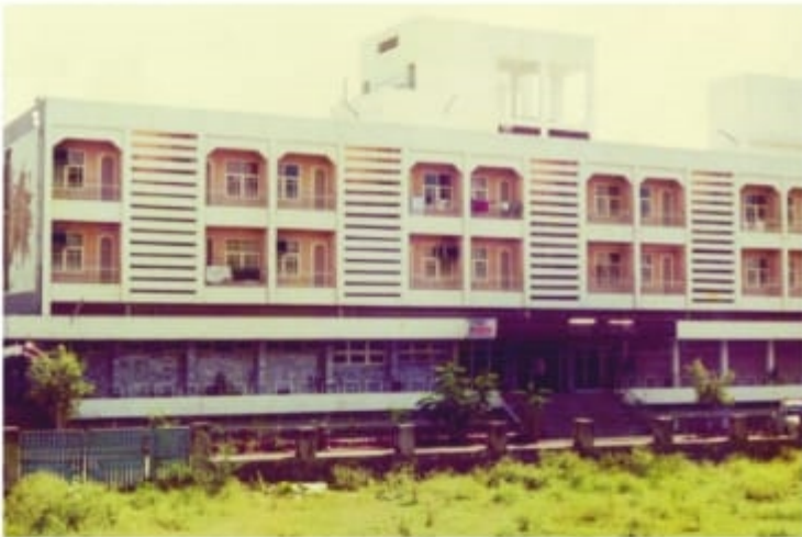
Hotel Premdan Ahmednagar