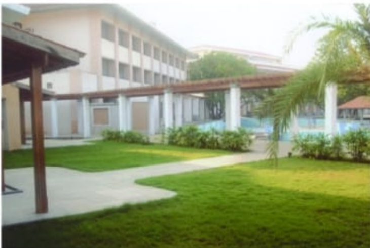
Row Cottages - Sahil Group Alibaug