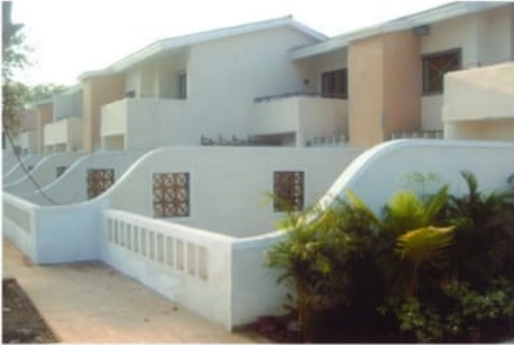
Villas - Sahil Group Alibaug