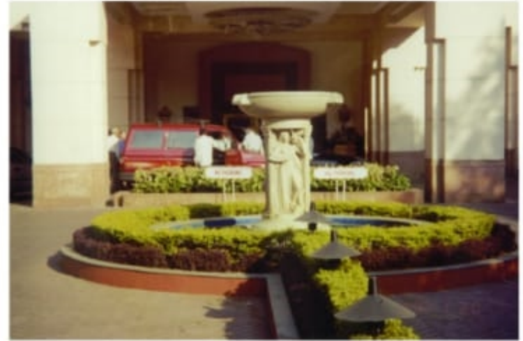
Hotel Taj Blue Diamond Pune