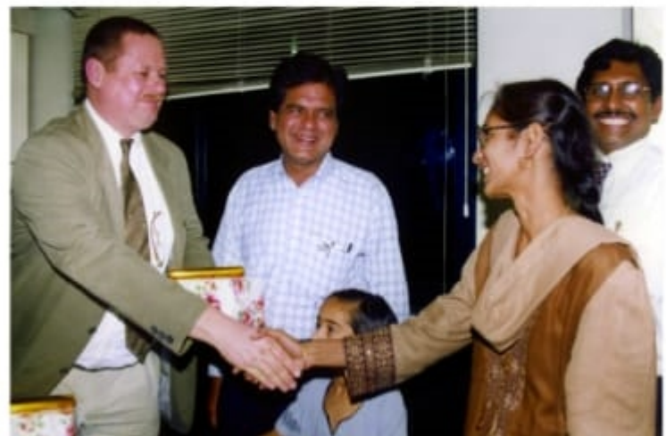
American Auditor at Ahmednagar Office during ISO Audit