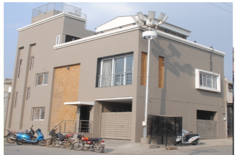
renovation of residential bungalow Ahmednagar