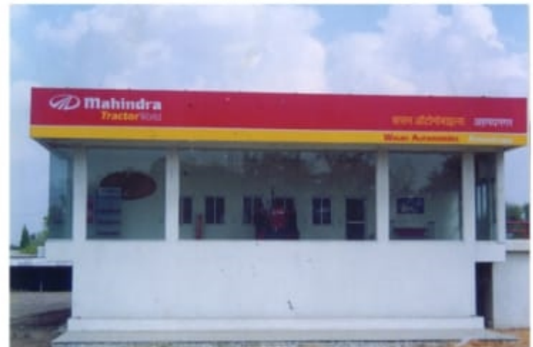
Wasan Automobiles (Mahindra Tractors) Ahmednagar