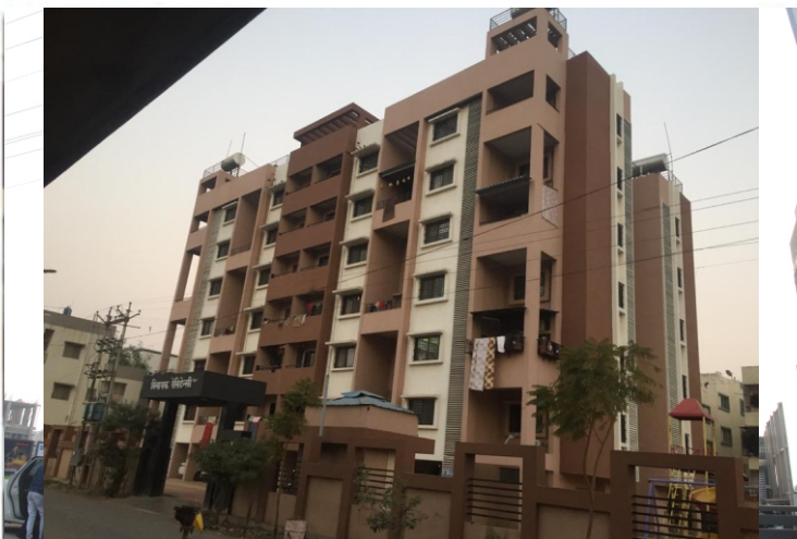
Vinayak Residency Ahmednagar