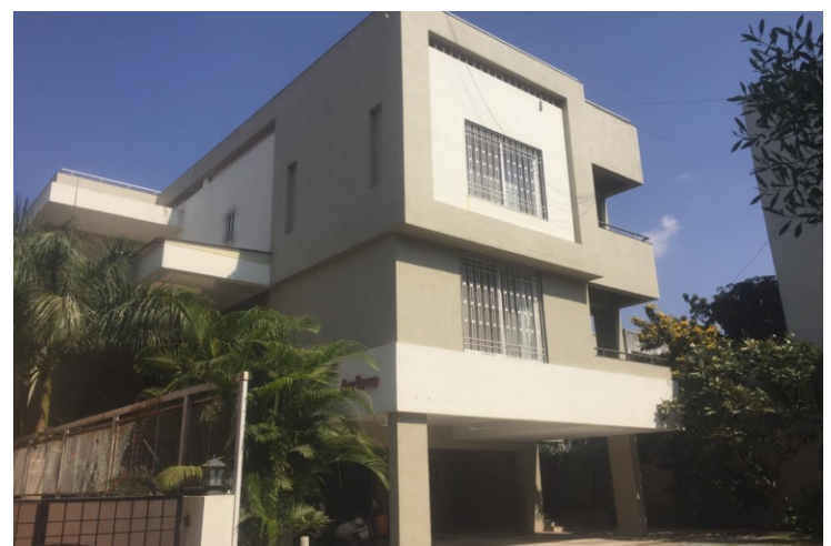
Residential Bungalow (Best construction Award) Ahmednagar