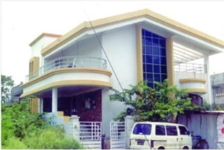
Residential Bungalow Ahmednagar