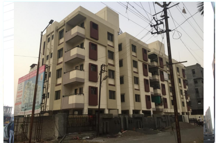
Vinayak Residency Ahmednagar