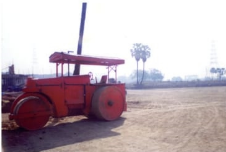
Site Development & Roads Bharati Vidyapeeth, Navi Mumbai