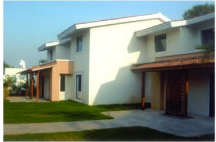
Villas - Sahil Group Alibaug