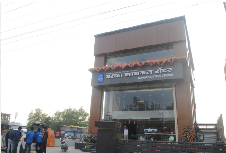
Commercial Building Ahmednagar