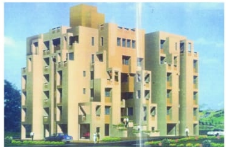
Balewadi Staff Quarters - Bharati Vidyapeeth Navi Mumbai