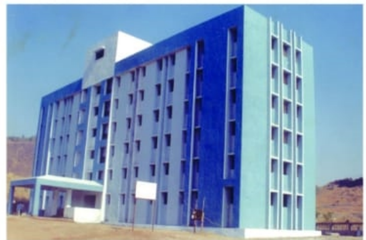
Boys Hostel - Bharati Vidyapeeth Navi Mumbai