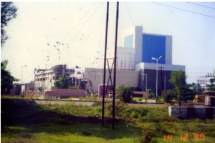
Sterlite India Ltd. Aurangabad