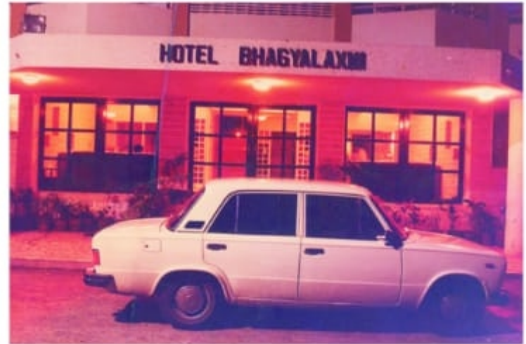
Hotel Bhagyalaxmi Shirdi