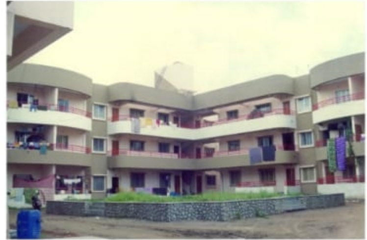
Kohinoor Garden - Residential Scheme Ahmednagar