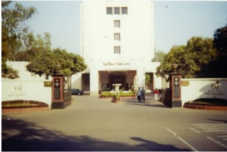
Hotel Taj Blue Diamond Pune

MODERA BUILDCON ENGINEERS & CONTRACTORS The League of Trust Continues