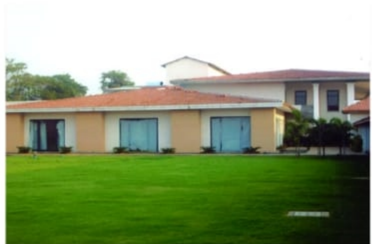
Main Block - Sahil Group Alibaug