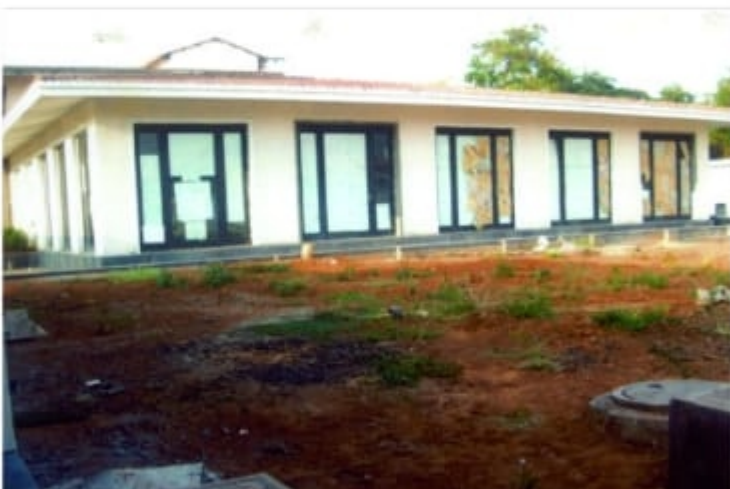
Restaurant - Sahil Group Alibaug