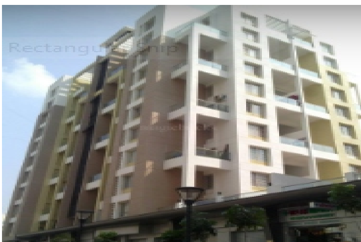
Lohia Jain Group Bavdhan