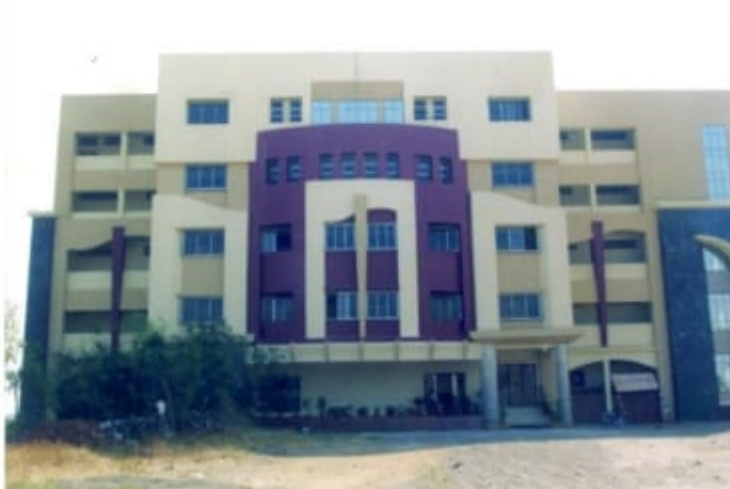
English Medium School - Bharati Vidyapeeth Pune